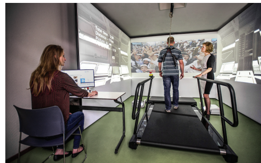
Figure 2. Image of the 3MDR set-up. The hardware included a dual-belt treadmill, a 180° projection on 3 screens by 3 projectors, and a surround sound system. The software consisted of a purpose-built virtual environment to walk in, personalized for each patient with images and music selected by patients. Participants wore a harness whilst on the treadmill for safety reasons. The therapist was standing alongside the veterans. A junior psychologist operated hardware and software.

3MDR is a manualized TFT. An extensive description of the theoretical framework and treatment protocol has been published (Van Gelderen et al., 2020; van Gelderen et al., 2018), and a summary description is provided here. A schematic overview of the 3MDR set-up is given in Figure 2. Patients selected pictures that strongly reminded them of their traumatic events. During 3MDR, patients walked on the treadmill